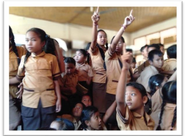
Image: Desa Datar, Trial Schools' Program, Child Safety 2019

'There is always a possibility that a child in the class has been the victim of some form of sexual abuse, but never disclosed the abuse to an adult. The teacher must avoid talking about what a child "should" or "must" do in these situations, but rather what they "could" or "may" do. Acknowledge that telling someone can be a very difficult thing to do. We want to avoid making a child victim feeling guilty or in some way responsible if they feel unable to tell someone about what has happened to them', (Project Karma Child Schools Program outline)