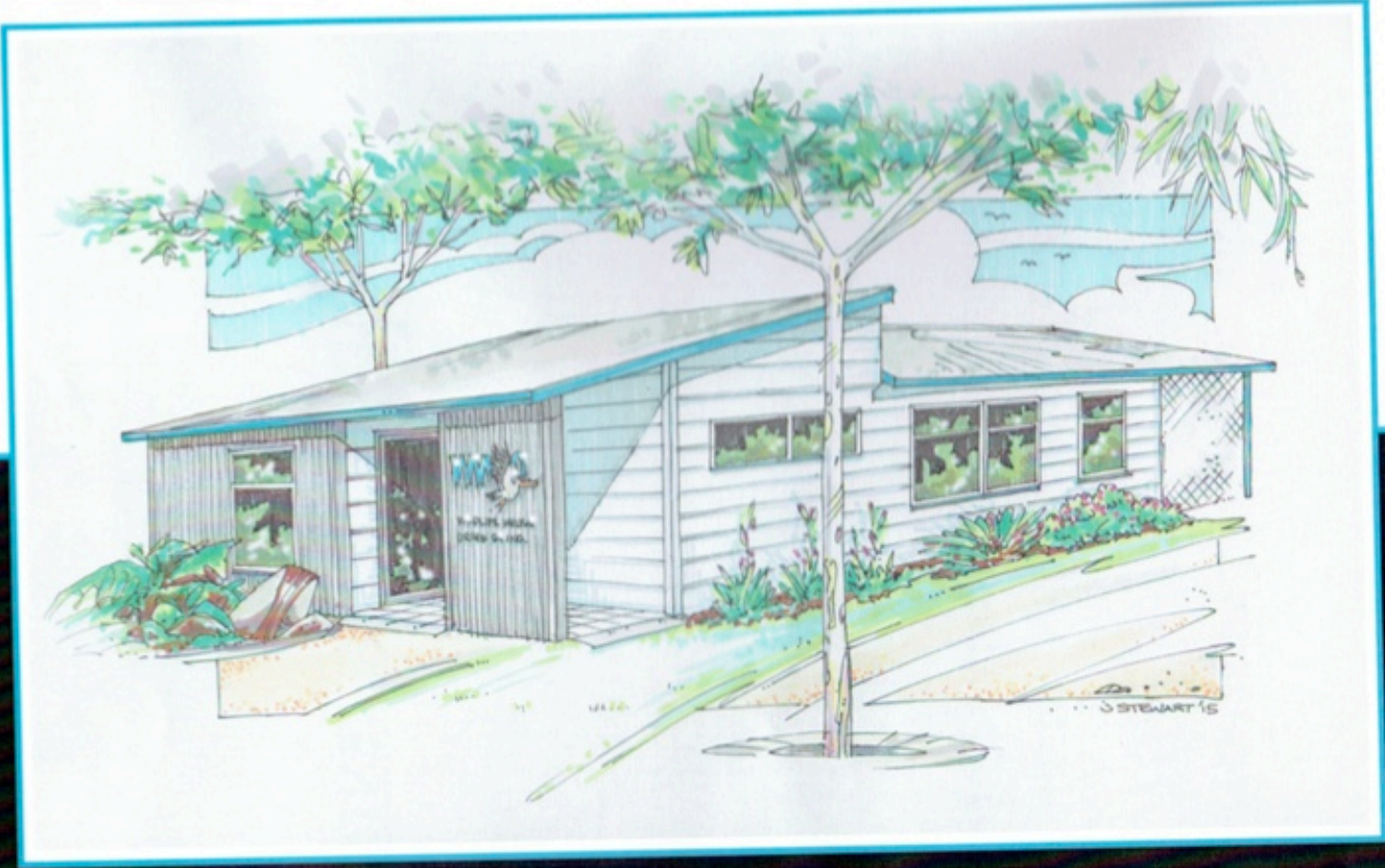
WILDLIFE WELFARE ORGANISATION (SA) INC.